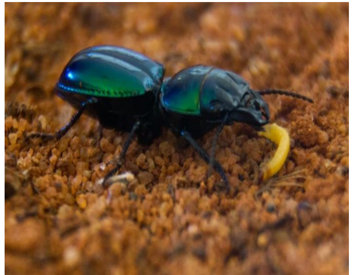
Carenum sp. (Coleoptera: Carabidae)