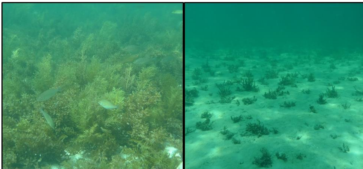
Figure 1. Seasonal changes in Ningaloo seaweed meadows from summer (left) to winter (right).

The Ningaloo Marine Park has an extensive network of seaweed meadows that cover up to half the total area of the lagoon. Many visitors to Ningaloo have noticed large amounts of seaweed washing ashore at certain times of the year (often during March–July), which is the result of foliose parts of the Sargassum breaking away from their stipes and holdfasts (Figure 1). Given these seaweed meadows are an important habitat for many other species, we need to understand the dynamics of annual variations and long term changes in the condition of these habitats. In this research project we measured the amount of seaweed (biomass) present in meadows at two locations (Tantabiddi and Coral Bay) within the Ningaloo lagoon over the summer (February), autumn (April), winter (August) and spring (November) for two years and explored whether changes in seaweed were linked to seasonal shifts in climate (sea temperature, wind direction and strength, wave heights, light and rainfall).