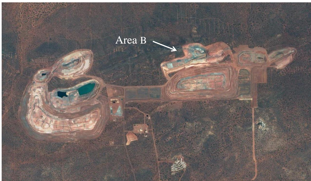
Figure 1: Aerial photo of Windarling Range and mine showing the location of Area B

Land Management Act 1984 . On this basis the EPA recommended that the direct requirement for the proponent to take action to reserve areas where the species occurs be removed and condition be reworded to include “measures to support the secure conservation tenure for the remaining population of T. paynterae subsp. paynterae ”, subject to seeking access to Area B. Seven Ministerial Statement approvals (627, 802, 843, 874, 900, 907 and 909) applying to the Yilgarn operations were issued between 2003 and 2012. These statements have been consolidated into a single Ministerial Statement (Statement #982) which was published on the 24 th September 2014. Under Statement #982, in relation to the T. paynterae subsp. paynterae , the proponent (Cliffs) are required to prepare and implement a Research and Management Plan and Recovery Plan if the proponent intended to apply for access to Area B for ground disturbing activity. The Research and Management Plan is to include monitoring of numbers of individuals, health, viability and reproductive success, ecological research and potential translocation, pollination vectors, management, and measures to support the secure conservation tenure.