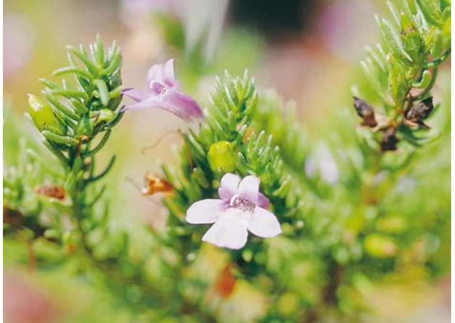
A close-up of the solitary purple flowers of rough emu bush.

Rough emu bush differs from heath-like eremophila ( Eremophila microtheca ) in its low growing habitat, slightly rough branches and foliage, hairless calyx segments, and less wrinkled fruits. It differs from Sargent's poverty bush ( Eremophila sargentii ) in that it is non-aromatic, has star-shaped hairs on the