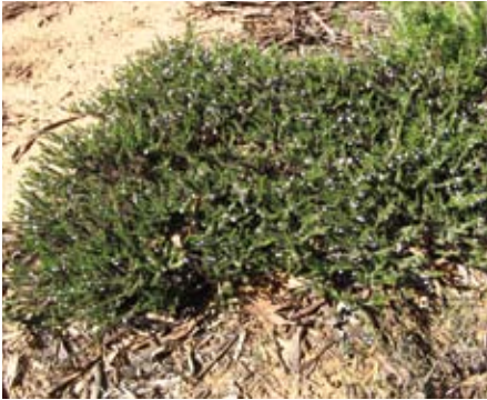
Rough emu bush is a low-growing, spreading shrub.

If you think you've seen this plant, please call the Department of Environment and Conservation's (DEC's) Moora District on (08) 9652 1911.