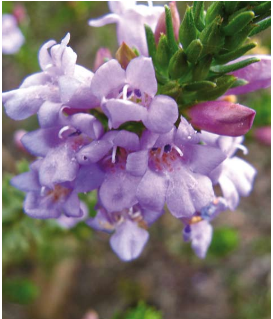
Above: A cluster of purple flowers on the rough emu bush. Below: Habitat of rough emu bush.

This project is funded by the Australian and State governments' investment through the Natural Heritage Trust, administered in the Midwest Region by the Northern Agricultural Catchments Council.