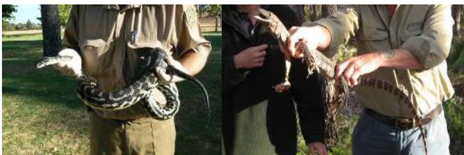
Figure 2: A carpet python (left) restrained with one hand controlling the head and the other supporting the body and a varanid (right) restrained with one hand around the front legs and one hand around the back legs.

This method is suitable for any medium-sized animal. It is a common method where both hands are used to hold the animal, usually one to restrain the head and the other to support the body and control the legs/tail. The head is held away from the body, and particularly the face, of the handler.