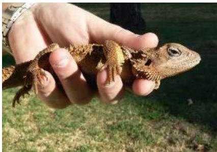
Figure 1: A bearded dragon restrained using thumb and index finger with the rest of the hand supporting the body. Photo: Christine Freegard/DBCA (left)

This method is suitable for small birds, amphibians, small to medium lizards, small bats, small rodents and small mammals. It involves the whole animal being restrained in a single hand. The thumb and index finger can be utilised to restrain the head.