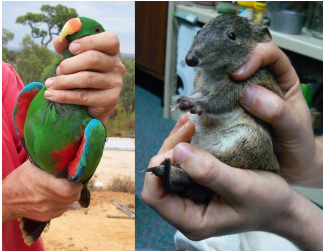
Figure 3: A parrot (left) restrained with one hand controlling the head and strong beak, and the other securing the feet, wings and supporting the body; and a quenda (right) restrained with one hand holding the neck and head, and the other holding the back legs and supporting the body