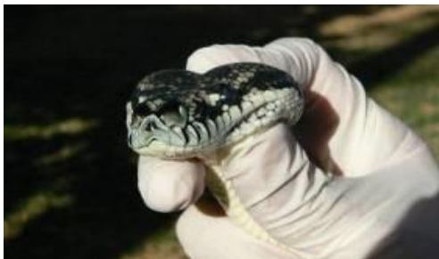
Figure 4: The head of a carpet python restrained using a three finger hold.

This method is suitable for small to medium mammals, reptiles and birds. It is used to restrain the head of an animal. The thumb and middle finger are placed on either side of the animal's head and the index finger placed on top of the head.