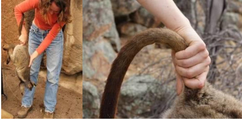
Figure 5: A rock wallaby grasped by the base of the tail using the tail grip.

It involves grabbing the base of the tail where it is thick and muscular and lifting the animal off the ground directing the legs away from the handler (Fowler, 1978b). The animal can then be placed into an appropriate handling bag (refer to the Department SOP for Animal Handling and Restraint using Soft Containment ). The animal should not be restrained in this manner for extended periods of time without supporting the body. Care should be taken to minimise the risk of spinal injury when using this technique.