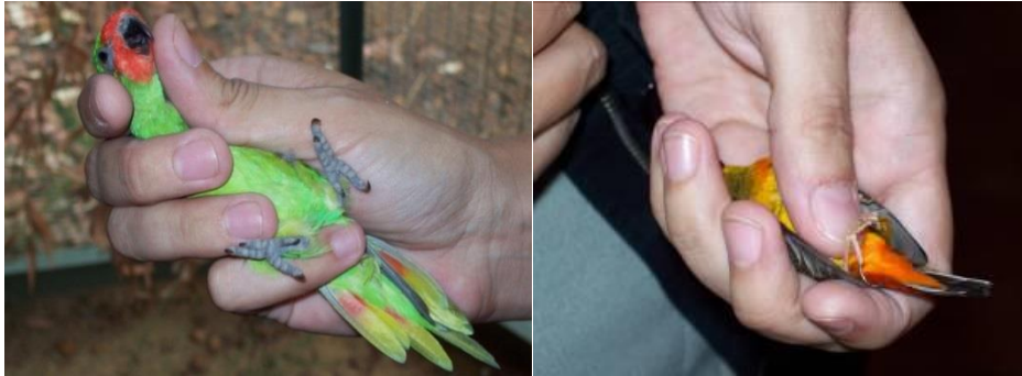
Figure 7: A lorikeet held in one hand using the ringers hold (left); and a finch being restrained using a reverse ringers hold (right).

This is suitable for small birds, but only for those that do not have sharp beaks as the head is not properly restrained. It is a one handed bird restraint method in which the bird is grasped with its back and closed wings against the palm of the hand, with the head facing downward towards the handlers wrist (FAO, 2007).