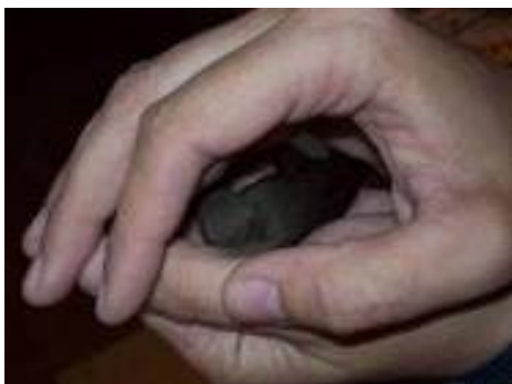
Figure 6: A finch cupped in hands.

This method is suitable for most small birds, amphibians, small to medium lizards, small bats and small rodents. It involves the whole animal being enclosed in one or two hands. This technique is not suitable for species that may bite, sting or scratch hands.