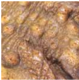
Skin of a cane toad.

The skin of a cane toad is dry and rough, rather than moist and slippery like the skin of many native frog species. The backs of male toads have raised warty lumps that feel like sandpaper when they're rubbed, while females have slightly smoother skin with less prominent lumps. The colour on top of an adult cane toad body ranges from dull brown to yellowish or blackish (never bright green, though juveniles have a brighter camouflage pattern that dims with age). The under parts are usually a dirty cream colour and juvenile toads have a grey and cream mottled pattern that may fade with age.