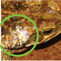
Glands of a cane toad.