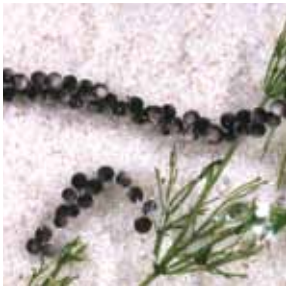
Cane toad eggs.

The egg masses (spawn) of cane toads are unlike those of most native frogs. Toads produce chains of black eggs about one millimetre in diameter enclosed in a thick, transparent, gelatinous cover forming long strands about three millimetres thick.