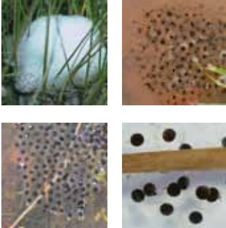
Native frog species eggs.