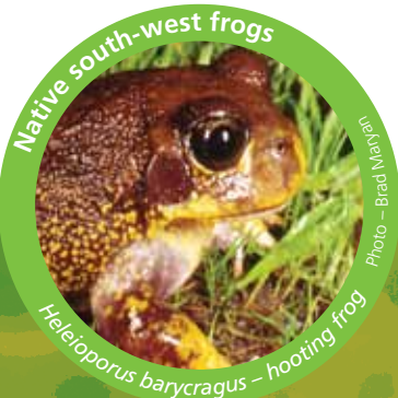
Helioporus barycragus - hooting frog

The call of a male toad is a guttural trill.