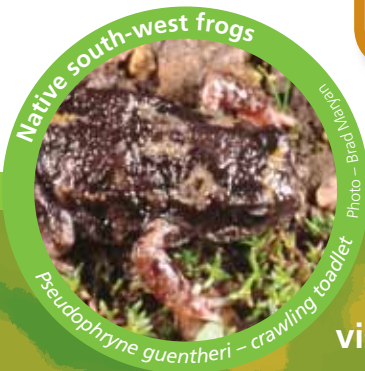
Pseudophryne guentheri - crawling toadlet

For more information about identifying native frogs visit www.museum.wa.gov.au/frogwatch