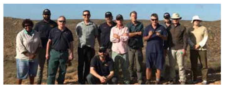
Above: Ningaloo Coast World Heritage Advisory Committee members, consultants and Parks and Wildlife Service staff taking in the view on top of Cape Range.

These habitats are part of the terrestrial component of the World Heritage area and are a key feature of the Outstanding Universal Value.