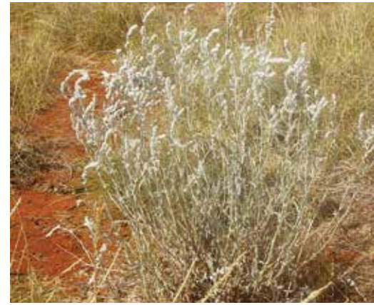
Above: Kapok ( Aerva javanica ).