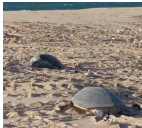
Above: Turtle highway on South Muiron Island.

Tracks and nests were recorded for green, loggerhead, hawksbill and even flatback turtles. While on South Muiron Island, staff were lucky enough to observe a female loggerhead turtle who was tagged on the same island 19 years ago to the day. While analysis is still underway, it is emerging that the Muiron Islands are a significant nesting area for loggerhead and green turtles.