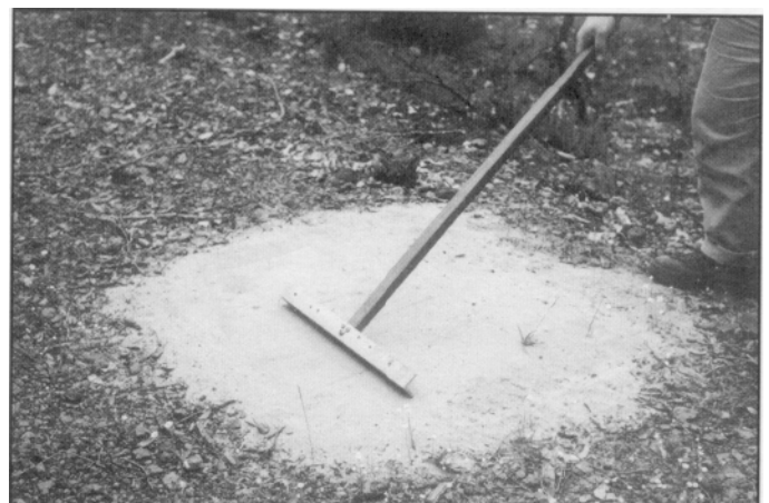
Smoothing a sand pad.

Tracks are most identifiable in clean, firm and slightly damp sand. Where this type of sand occurs naturally at a survey site, pads can be made simply by clearing and raking smooth a square plot at the desired locations. Where such sand forms the main substrate along extensive vehicle tracks and firebreaks the technique can actually be extended to using the tracks as a 'plot' by smoothing a 1.5-2m wide strip with a heavy drag towed from a vehicle. In other cases sand will have to be brought in specially to create the sand pads. The best sand to use is the yellow brick-layers' sand often used on building sites but it is very important that this sand is clean and certified free of weeds as well as Phytophthora spp and other known plant pathogens.