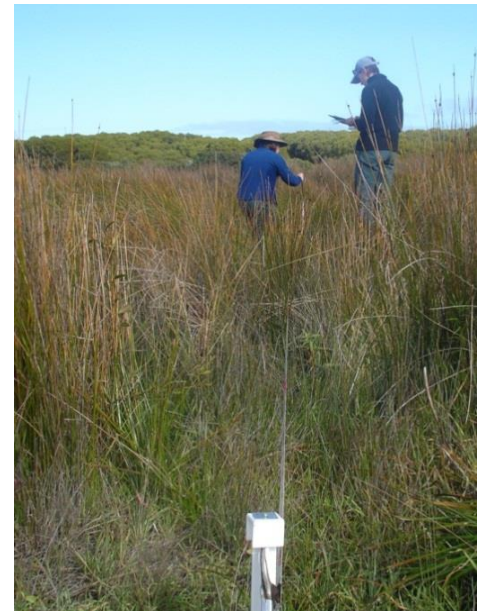
From left. Geraldton carnation weed forms dense monocultures where it invades coastal shrublands (photo 1). It is a short lived herbaceous perennial that can resprout from persistent roots following fire (centre). Measuring response and recovery of sedgeland in Holocene dune swales (photo 2).