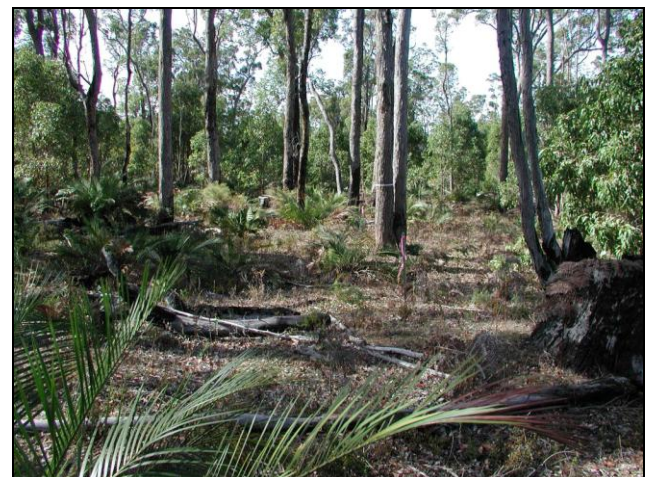
Above: Mature forest (left) and regrowth of jarrah and marri saplings in forest treated with shelterwood silviculture (right)

Grids at one of the five locations were sampled each year to measure stand structural attributes including basal area, species and size class distribution of overstorey trees. Surveys were also undertaken to determine the amount of regeneration present as seedling and advance growth.