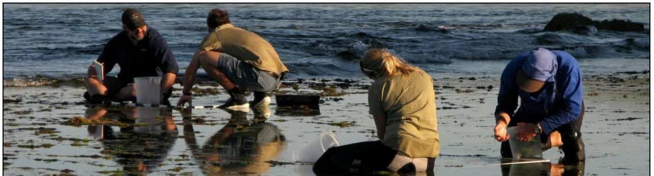
Above: DEC staff surveying a reef in the Marmion Marine Park.