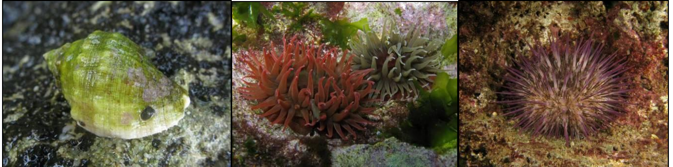
Common intertidal reef species. Left to Right: a cart-rut shell Dicathais orbita , two sea anemones ( Actinia tenebrosa ) and a purple sea urchin ( Heliocidaris erythrogramma ).

In contrast, high energy reefs tended to support a relatively sparse algal assemblage, often dominated by short turf and encrusting coralline species. Here also, the invertebrates were more likely to be hardy species such as abalone, chitons, anemones and limpets that can adhere strongly to the rock surface and are not easily dislodged by wave action.