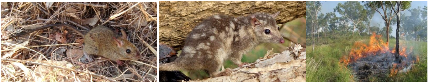
Brush tailed rabbit rat, northern quoll, low intensity hand burning in humid months.

Present reported declines in threatened mammals across northern Australia's tropical savannas has implications for the Kimberley which is the last mainland area with an intact suite of these mammals. Very frequent (occurring every 1-3 years) and extensive (>1,000 km 2 ) wildfires have been implicated in these declines, with approximately 35 percent of savannas burnt annually. In 2003, the department initiated fire ecology research and monitoring in the Kimberley. This work included repeated mammal trapping and vegetation surveys across savanna habitats, and different tenure and land management types.