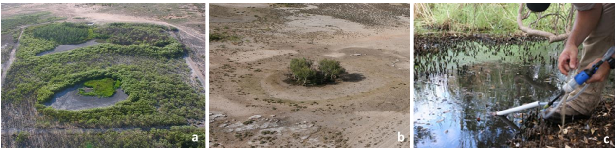
Above: Photographs of a. Saunders Spring (view to the east) showing fenced boundary and tracks, bare ground where seasonal spring moats form with fringing vegetation and a peat mound to the north-east, b. Stockyard Mangrove (view to the north) with sparse, heavily grazed vegetation, and c. sampling of spring groundwater discharge at Saunders Spring peat mound.